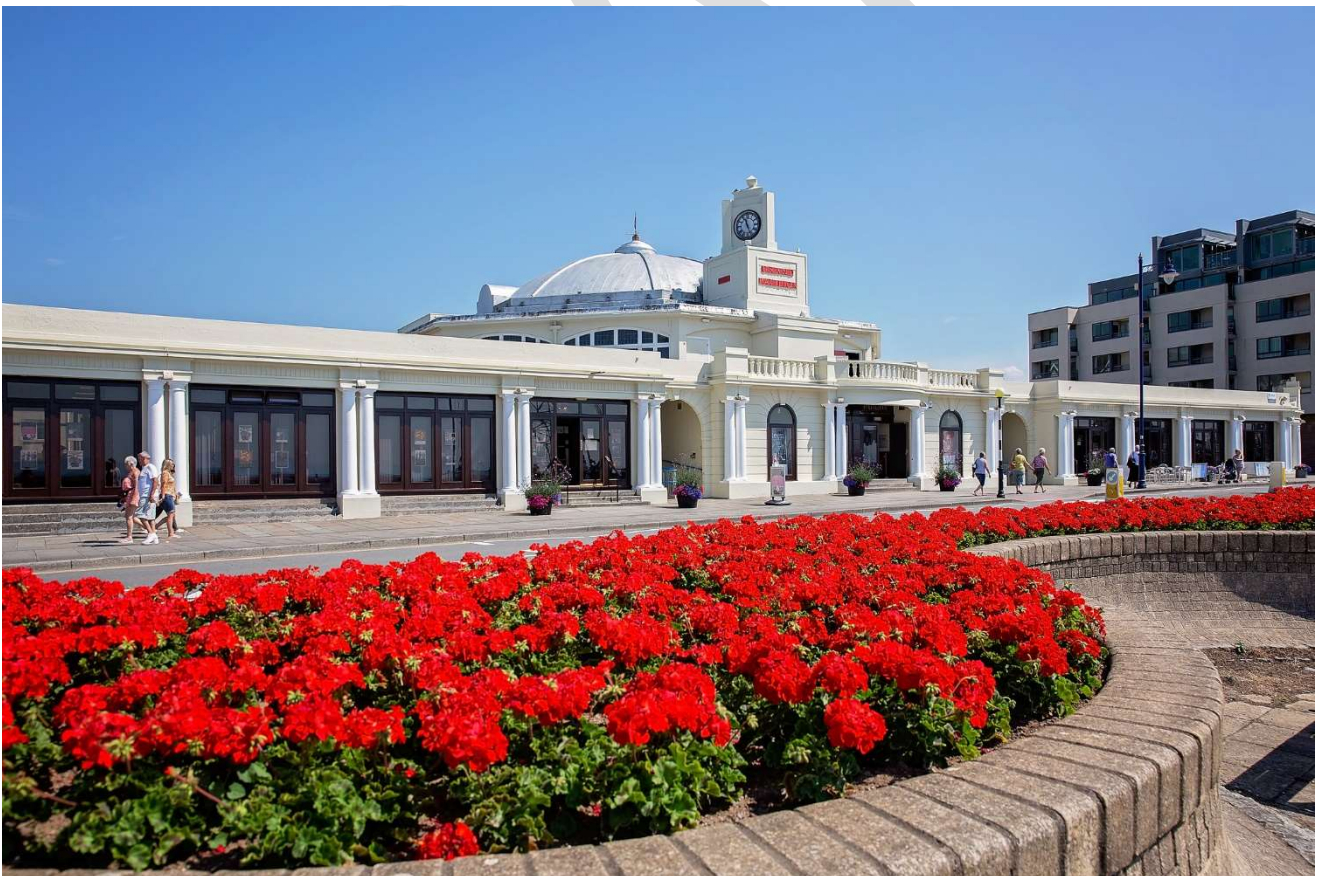
The Pavilion, Porthcawl

During the year there continued to be interim arrangements in place to cover the statutory position of the Council's Section 151 Officer/Head of Finance, which does cause some concern from a continuity and capacity perspective. Whilst there is little or no risk in the short term as the current Statutory Officer is extremely experienced and more than capable to fulfil the role, it is important that the interim position is permanently addressed as soon as possible. To help strengthen the resilience of the Finance function, a temporary Deputy Head of Finance and Section 151 Officer post was appointed in May 2019. Following a review of the Head of Finance role, Council agreed the post should be re-designated as Chief Officer, Finance, Performance and Change. The post was subsequently advertised at the start of 2020, but there was not sufficiently qualified applicants to be able to progress through all stages of the appointments process.