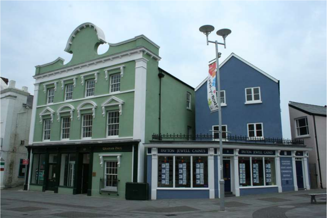
Dunraven Place regeneration